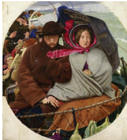
Ford Madox Brown