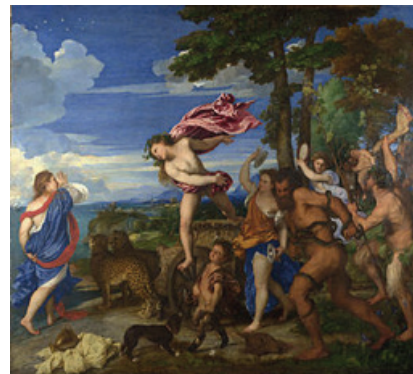
Titian Bacchus and Ariadne Painting

The images on this page could help you think about possible ideas and could be used to support any starting point. You may prefer to explore and respond to other images.