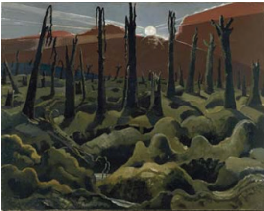
Paul Nash We Are Making A New World Painting