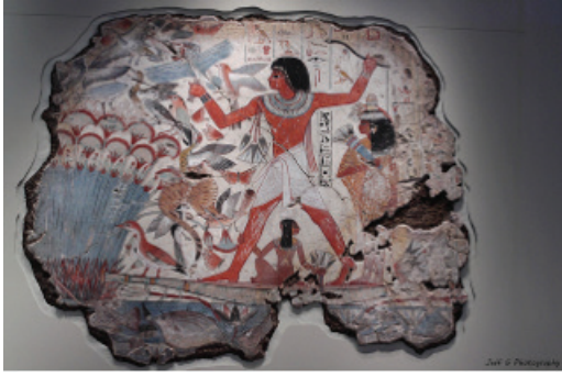
Unknown artist Nebamun Hunting In The Marshes Wall painting