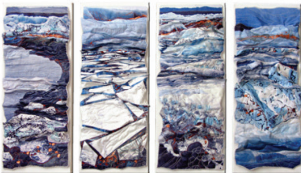
Sandra Meech Ice Slice Textile