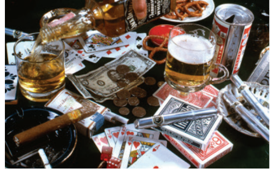
Audrey Flack Royal Flush Painting