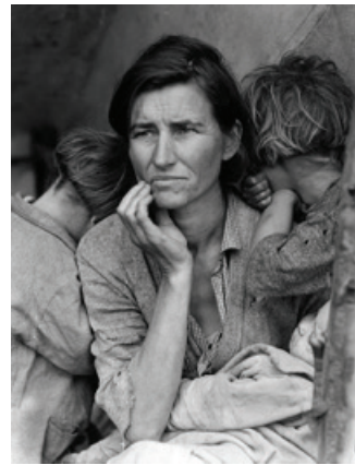
Dorothea Lange Migrant Mother Photograph