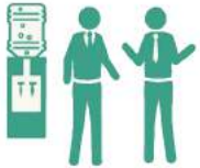
to have a break