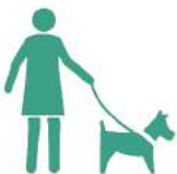
to walk the dog