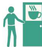
to go to a café