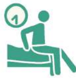
to get up