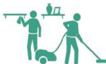
to do the housework