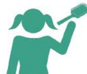
to brush your hair