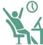
to finish work