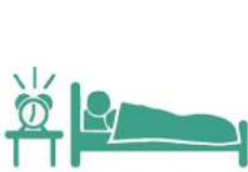
alarm goes off