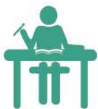
to do homework