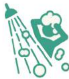
to wash your hair