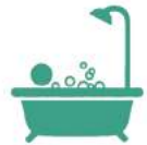
to take / have a bath