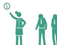
to arrive late