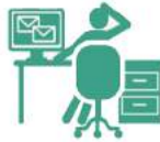
to check your emails