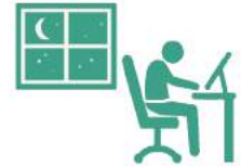
to work overtime