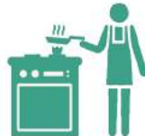
to cook dinner