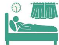
to go to bed