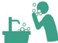
to wash your face