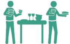
to clear the table