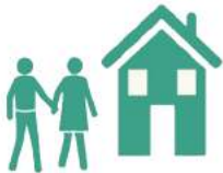
to go home