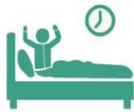
to wake up