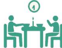
to have / eat dinner