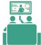
to watch TV