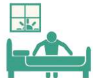
to make the bed