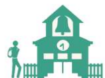
to go to school