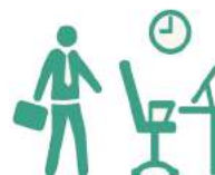
to go to work