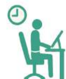
to start work