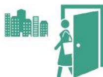
to leave the house