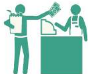
to buy groceries