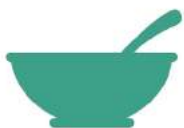
to have / eat breakfast