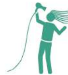
to dry your hair