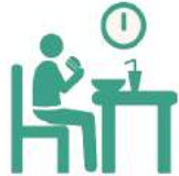
to have / eat lunch