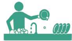
to do / wash the dishes