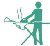
to iron a shirt